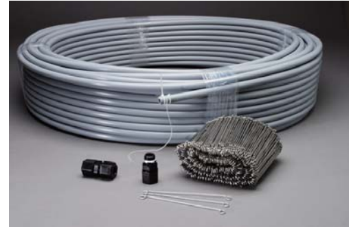
The EZ-400NSS Lightweight Non-Split Conduit Kit. As with standard conduit, the lightweight protective conduit is available in any required color.

As with all Fiber SenSys conduit kits, the EZ-400NSS conduit kit comes with 100 meters of non-split conduit; however, the EZ-400NSS also comes with a bundle of slimmer, 18 AWG wire ties for attaching the conduit to the fence. A 1/2-inch box coupler and 1/2-inch conduit-to-conduit coupling device is included as well. Conduit is available standard in black or gray, but may be ordered to any customer-specified color.